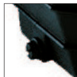
Drain plugs for an easy wintering