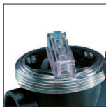
Transparent strainer basket